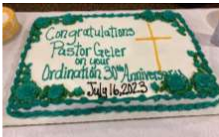
The celebration cake served 100 celebrating members